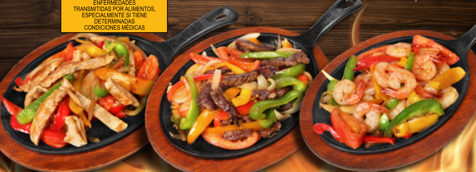
Fajitas de Pollo

Ensalada de Pechuga de Pollo 18 99 Lettuce, tomato, cucumber, onion and avocado. Served with chicken breast (No rice and beans)