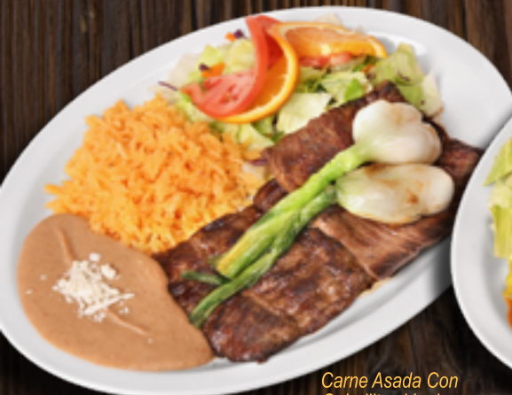
Carne Asada Con Cebollitas Verdes