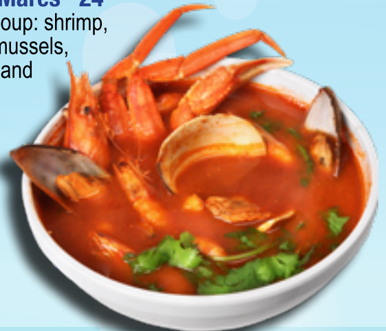
Caldo Siete Mares