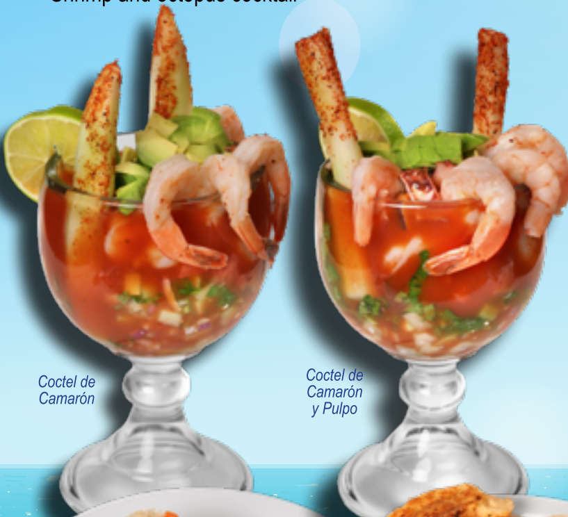
Coctel de Camarón

Seafood mix soup: shrimp, prawns, fish, mussels, baby scallops and crab legs