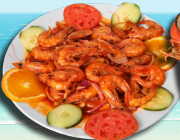
Camarones Cucaracha 30 99 Fried shrimp with Huichol sauce