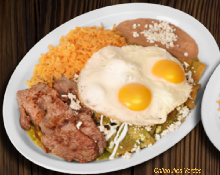
Chilaquiles Verdes Con Huevos & Rib Eye