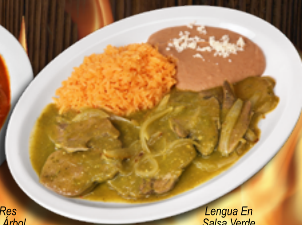
Lengua En Salsa Verde