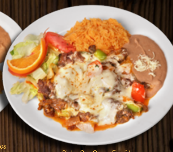
Bistec Con Queso Fundido