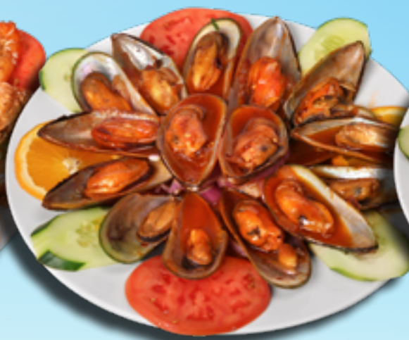
Mejillones Sm 17 99 Lg 36 99 Mussels in Nayarit sauce