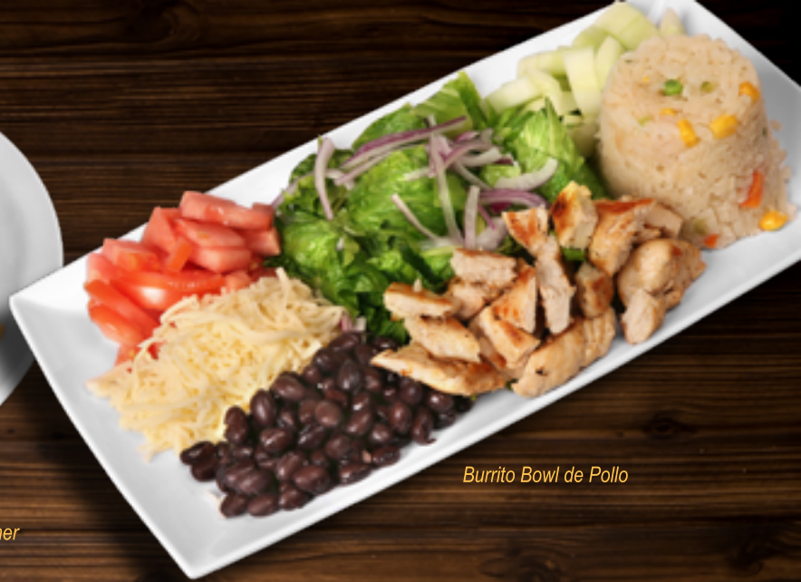
Burrito Bowl de Pollo