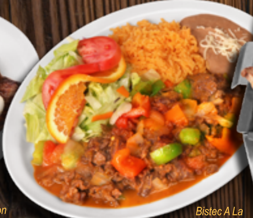
Bistec A La Mexicana