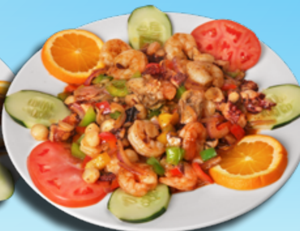
Chapuzón Sm 33 99 Lg 63 99 Shrimp, octopus, oysters