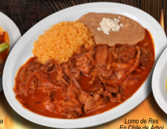
Lomo de Res En Chile de Arbol