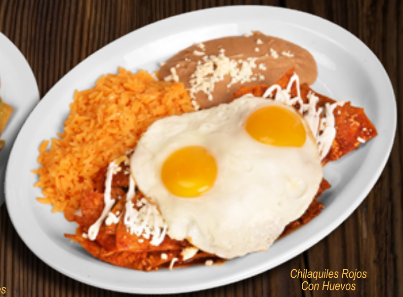
Chilaquiles Rojos Con Huevos