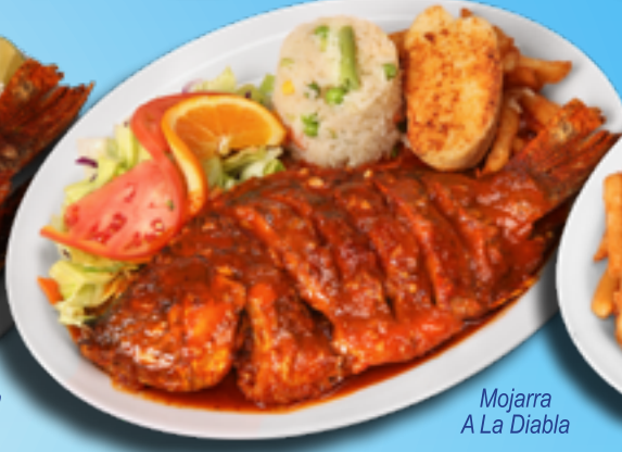
Mojarra A La Diabla