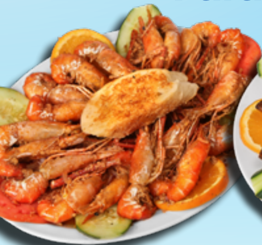
Langostinos Prawns Nayarit style Dinner 28 99 Sm 35 99 Lg 70 99