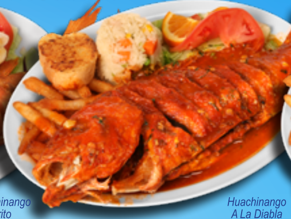
Huachinango A La Diabla