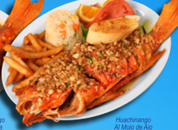
Huachinango Al Mojo de Ajo