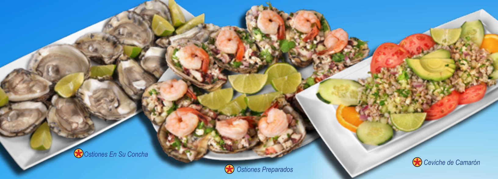
✳️ Ostiones En Su Concha