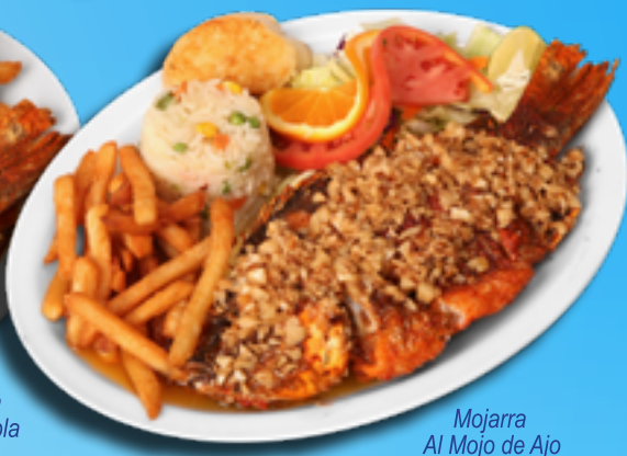
Mojarra Al Mojo de Ajo